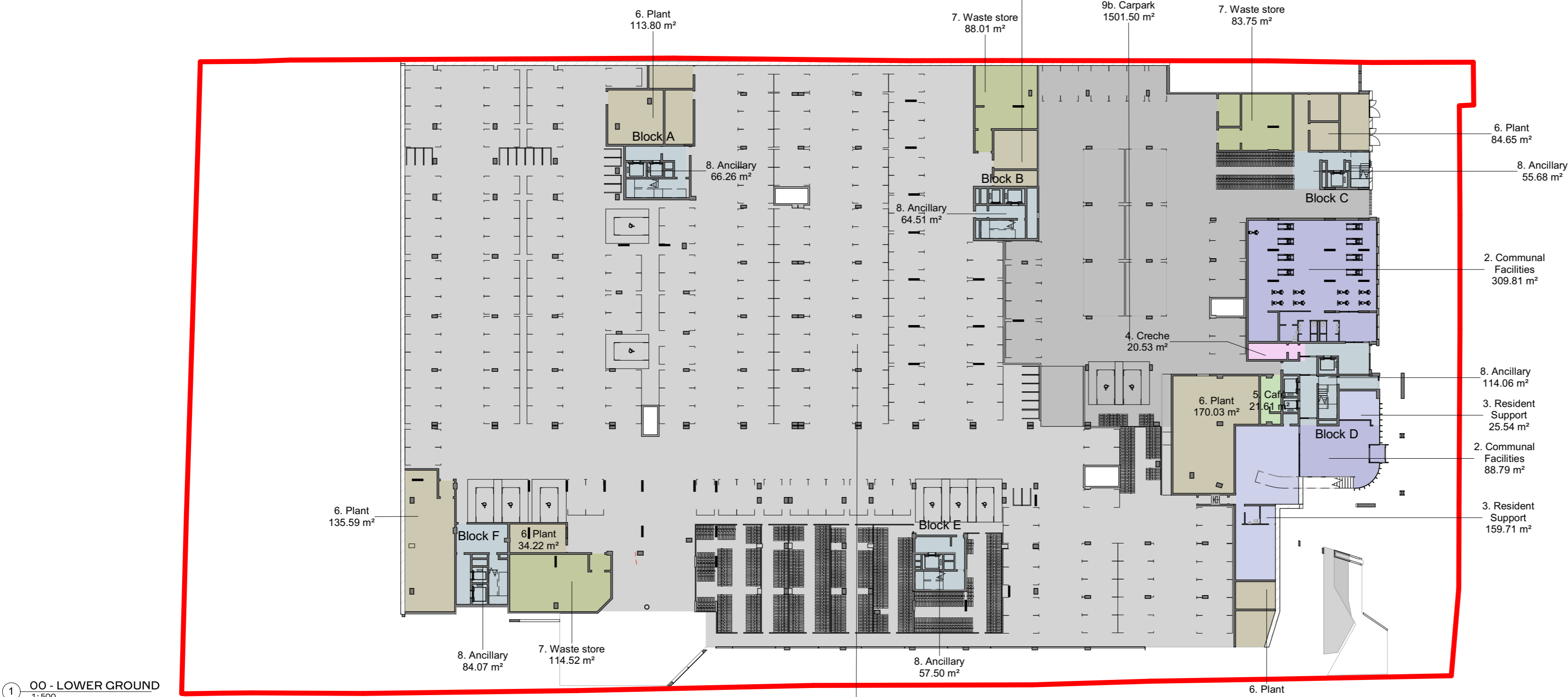
1 00 - LOWER GROUND 1:500