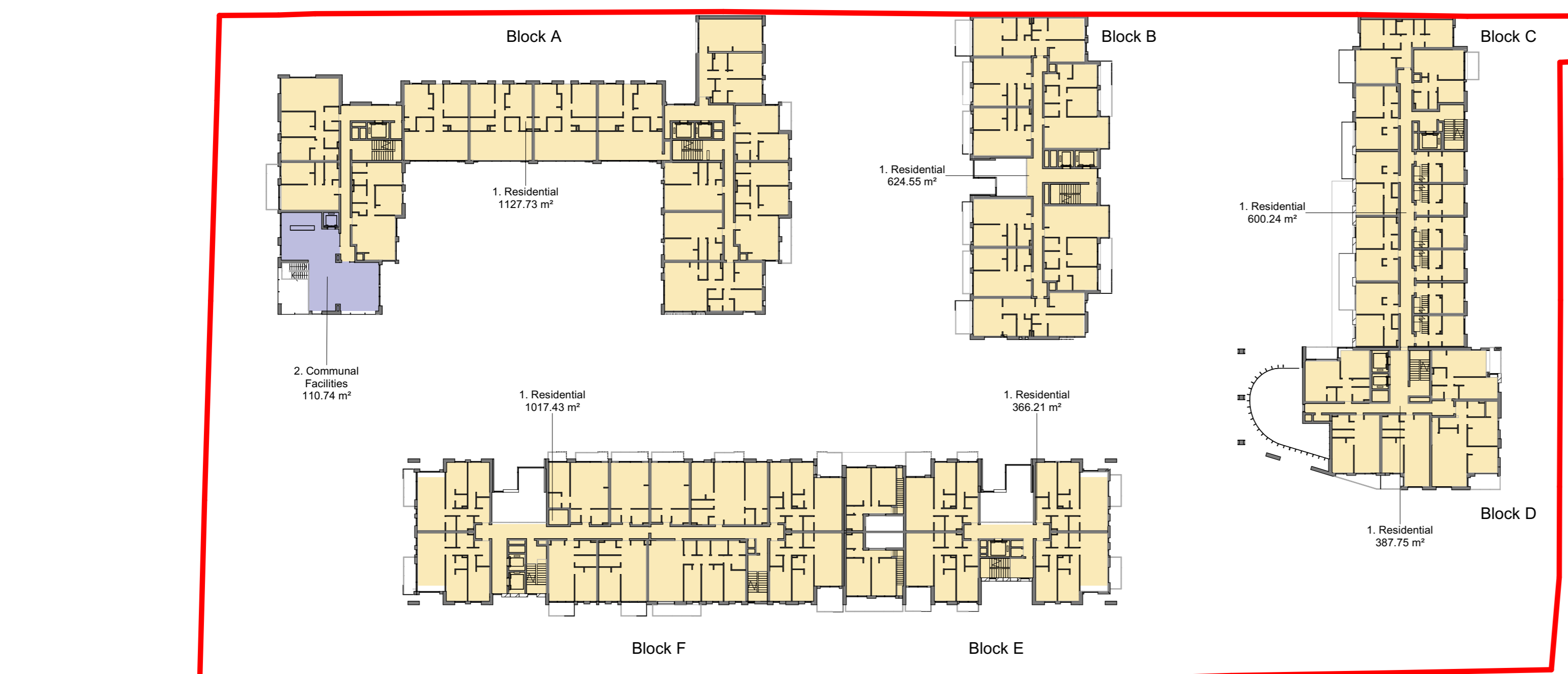
3 02 SECOND FLOOR 1:500