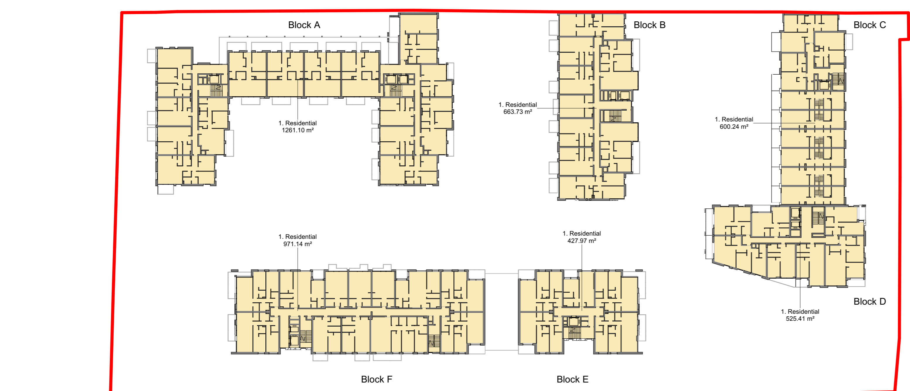
4 03 - THIRD FLOOR 1:500